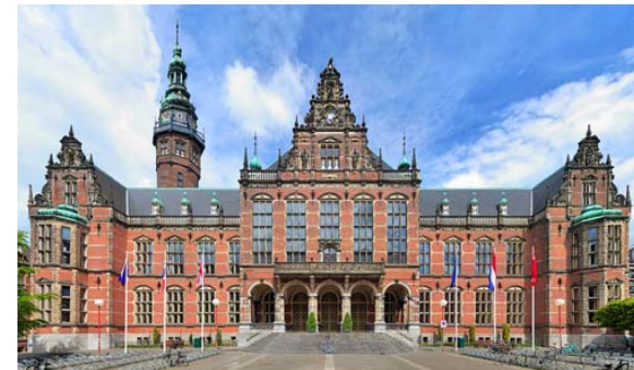
University of Groningen, the Netherlands