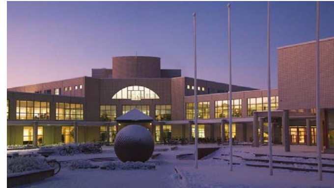
Oulu University, Finland