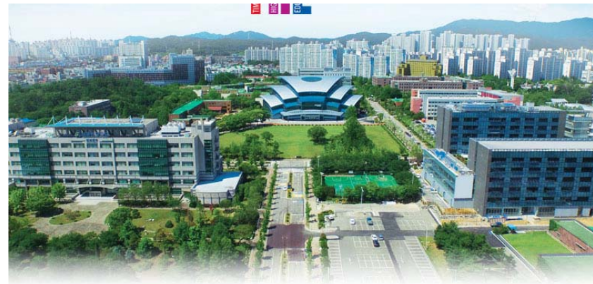
Sungkyunkwan University, South Korea