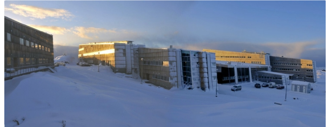
University of Greenland