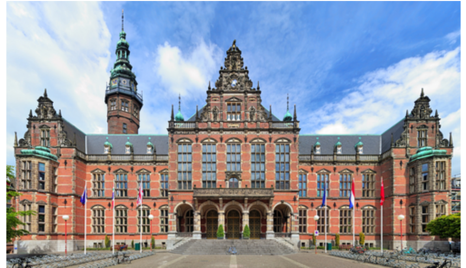
University of Groningen, the Netherlands