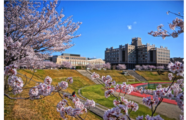
Ritsumeikan University, Japan