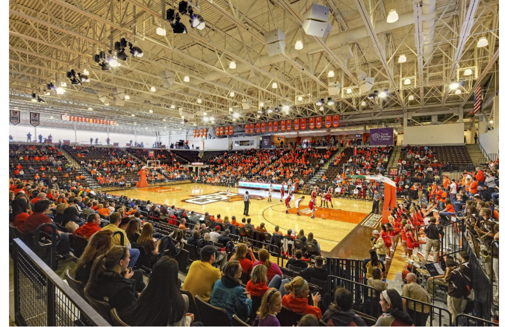
Bowling Green State University, USA