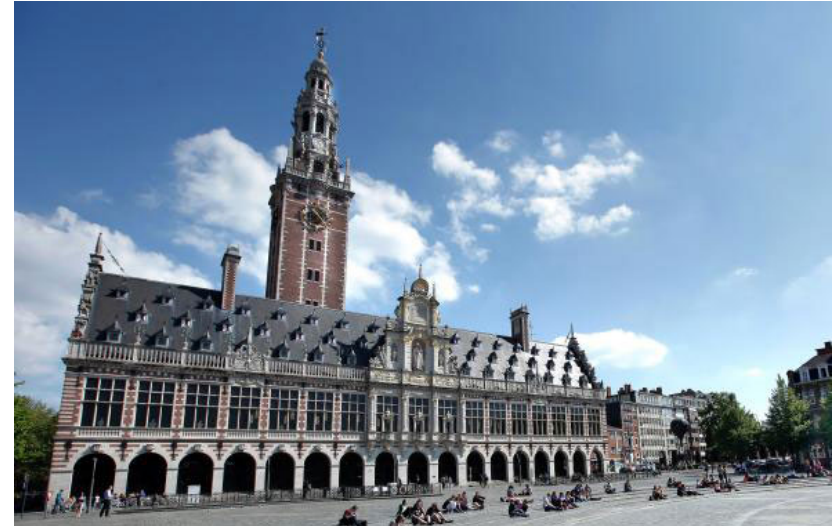
KU Leuven, Belgium