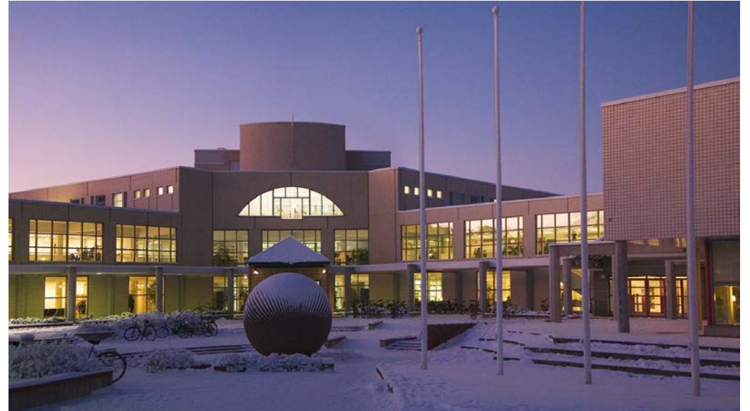
Oulu University, Finland