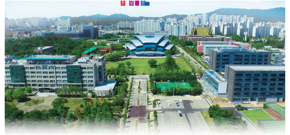
Sungkyunkwan University, South Korea