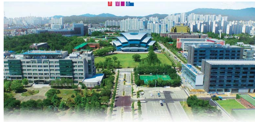
Sungkyunkwan University, South Korea