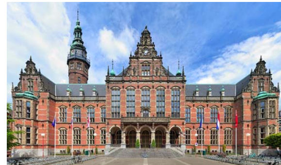
University of Groningen, the Netherlands