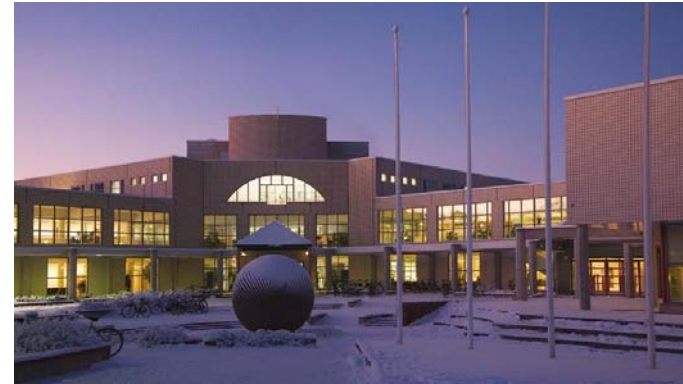
Oulu University, Finland