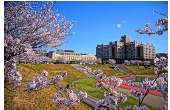
Ritsumeikan University, Japan