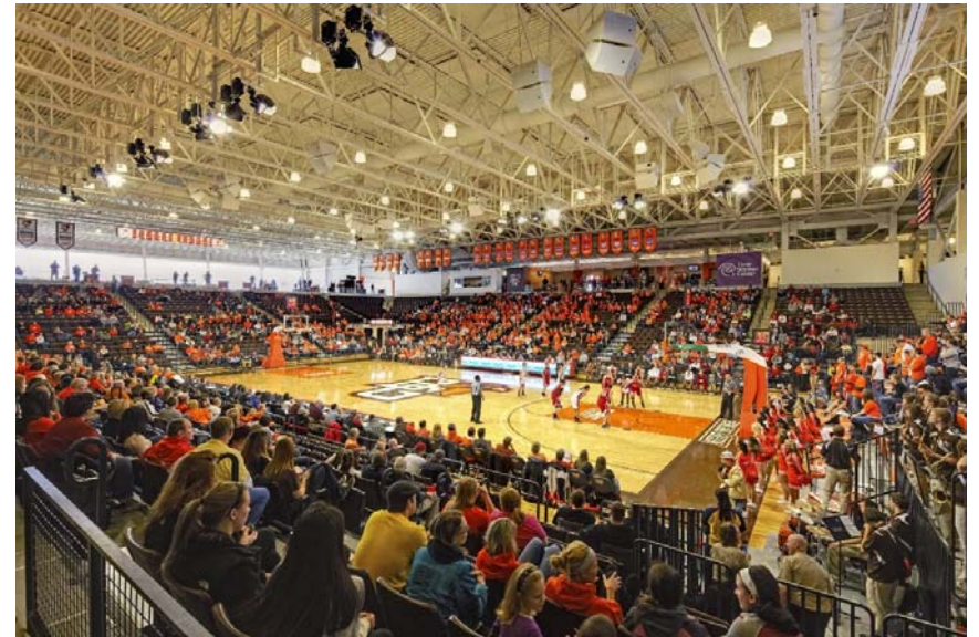
Bowling Greene State University, USA