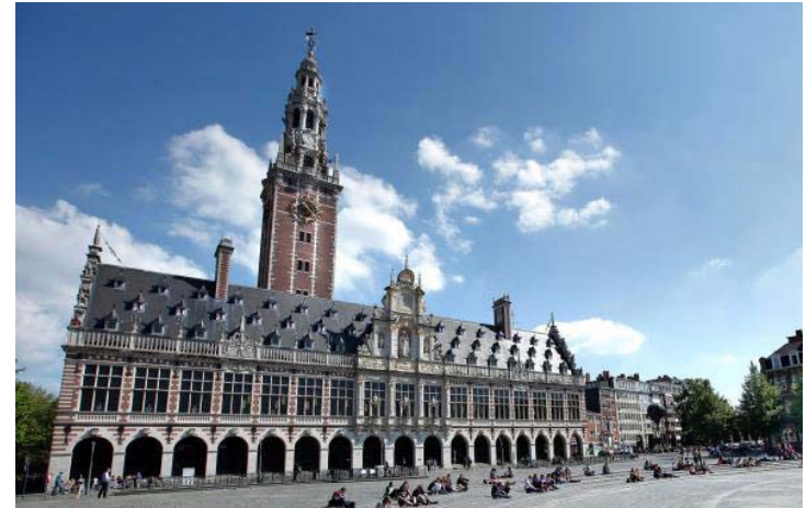
KU Leuven, Belgium