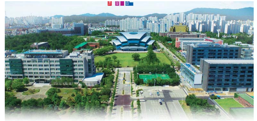
Sungkyunkwan University, South Korea