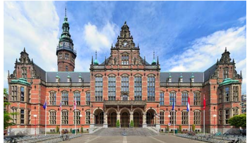
University of Groningen, the Netherlands