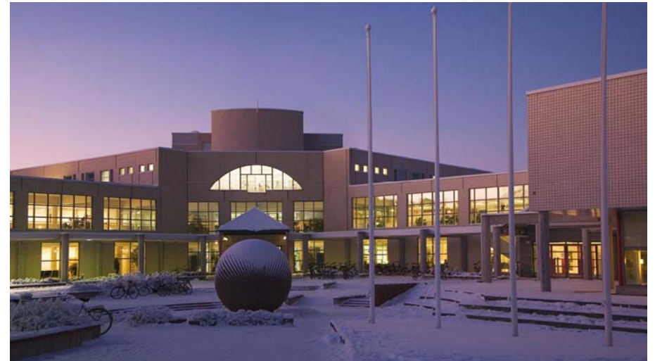
Oulu University, Finland