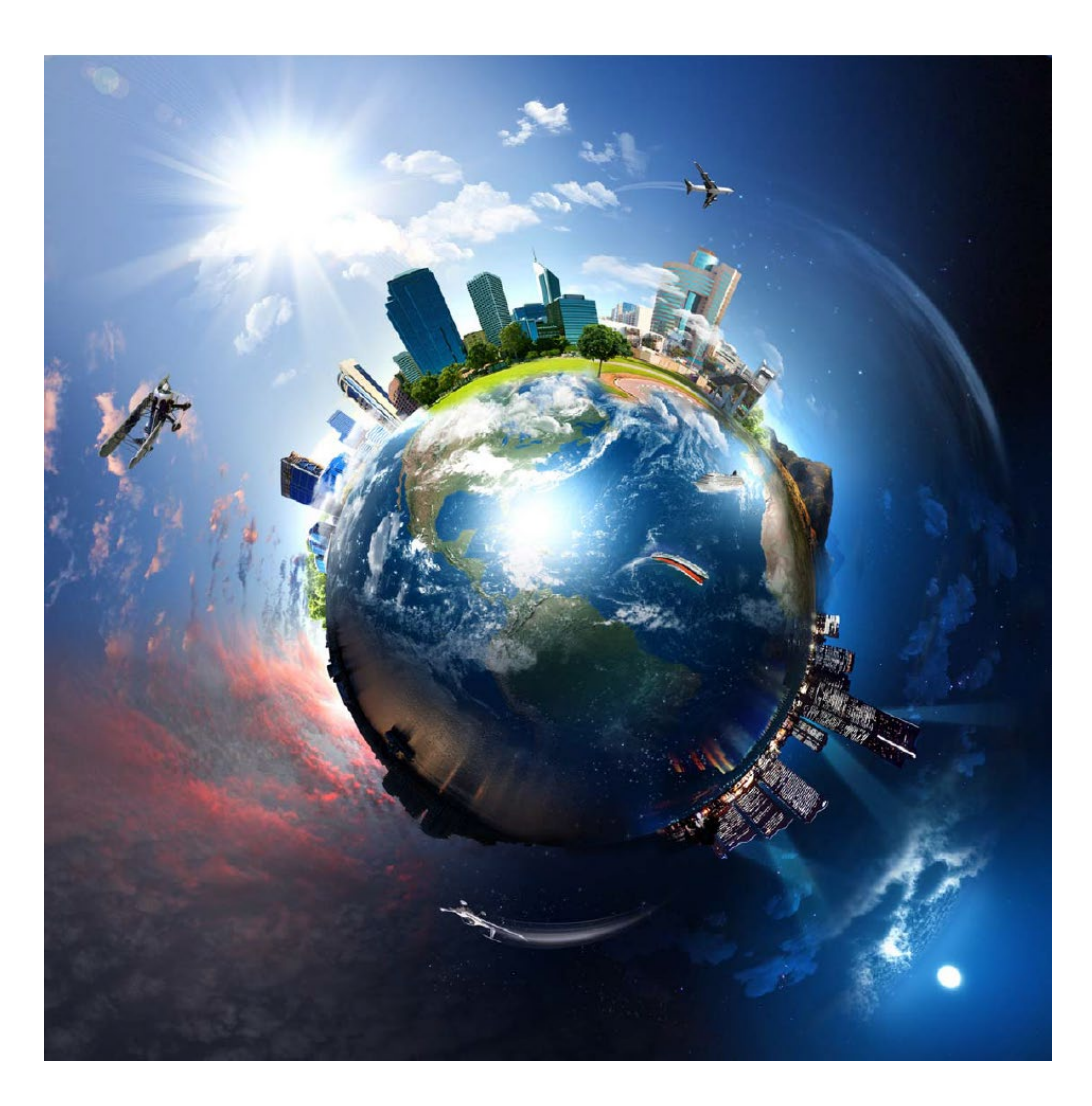
Application deadline 1 March 2024