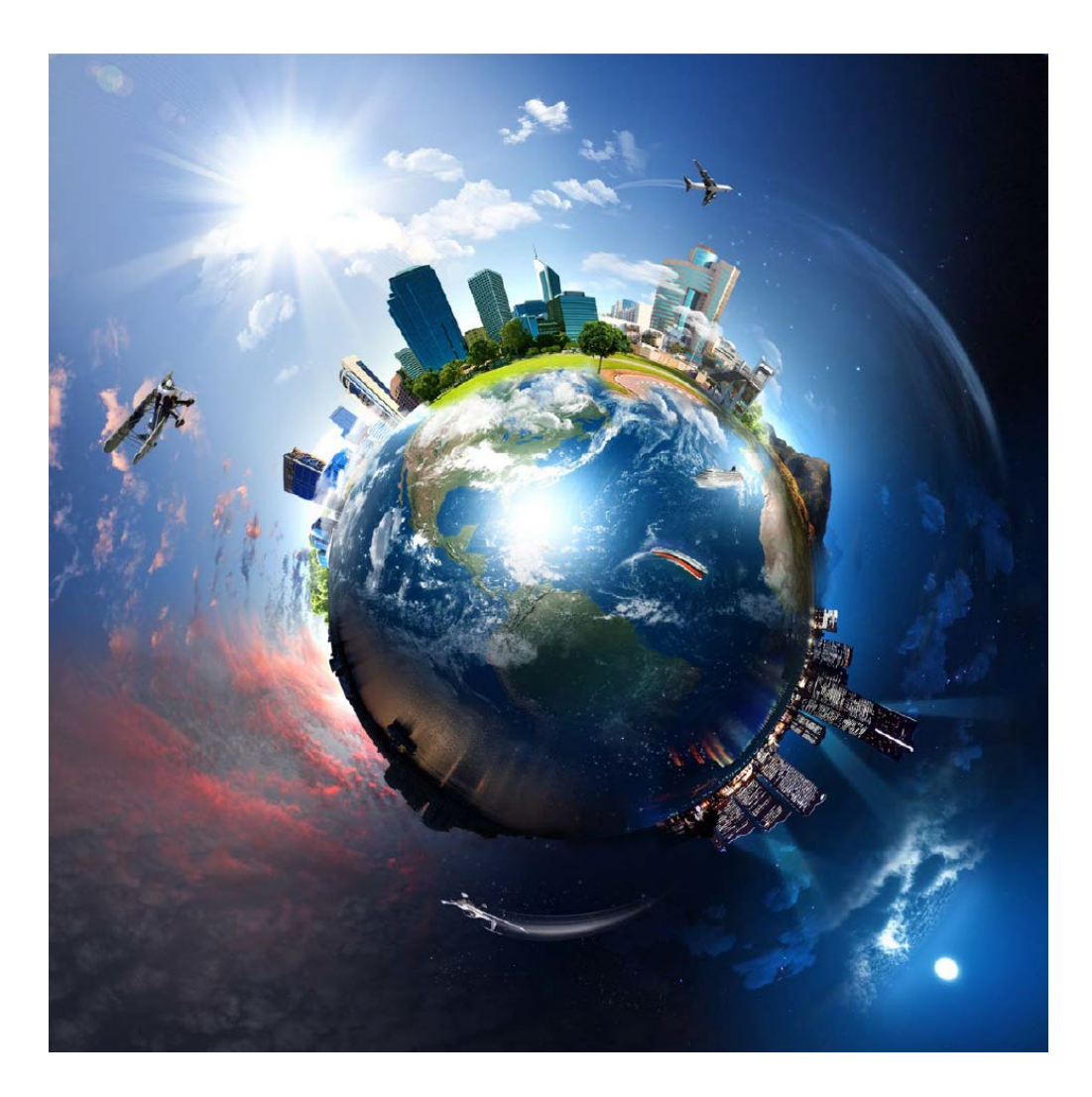
Application deadline 1 November 2021